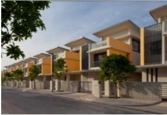
The Garland, Quận 9, HCMC