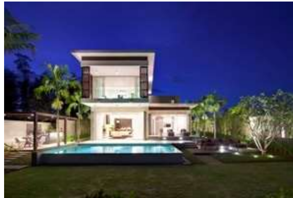
Norman Estates, Đà Nẵng