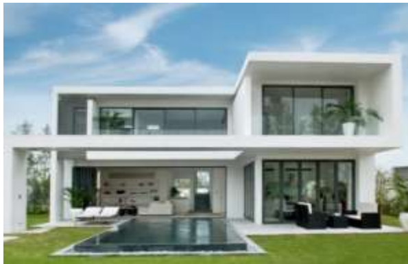
The Dune Residences, Đà Nẵng