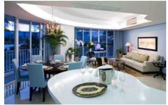
Azura, Đà Nẵng