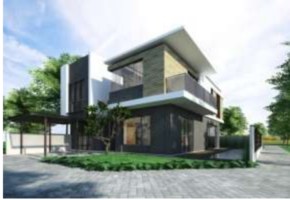
Mỹ Gia, Nha Trang