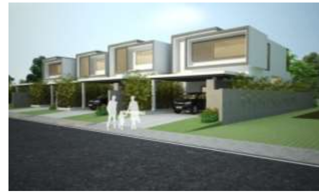
The Point, Đà Nẵng